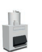
EC 15 with UBH1600 (sold separately)